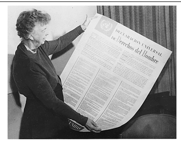
Eleanor Roosevelt with the Spanish version of the Universal Declaration of Human Rights.